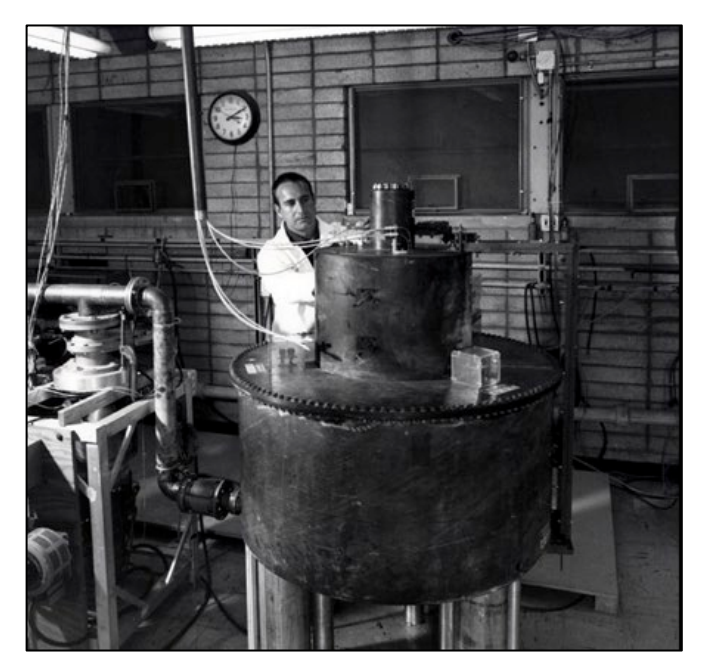
GA's Doublet I device, 1958

Our Energy Group encapsulates over six decades of fusion expertise and embodies the vanguard of scientific research and innovation in fusion technology. In recent