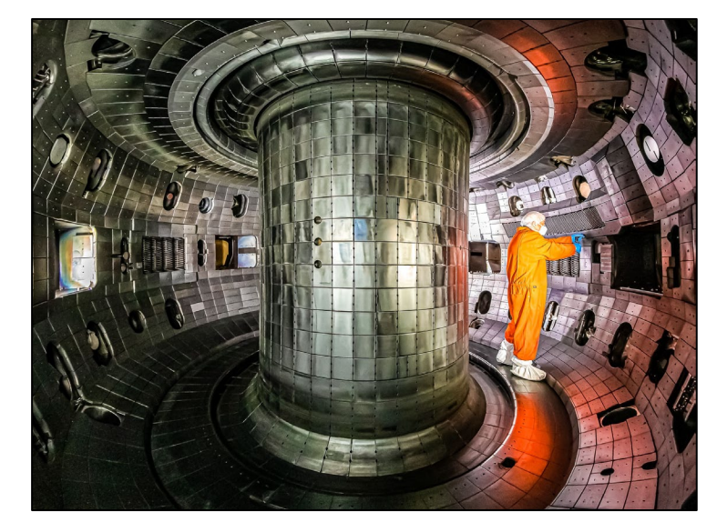
The Interior of the DIII-D tokamak, 2022

tokamak employing powerful electromagnets to shape and confine plasma, stems from the successes of our Doublet I and Doublet II tokamaks. These accomplishments earned GA the opportunity to construct the Doublet III tokamak, which achieved its first plasma in early 1978. Subsequently, the system was modified to adopt a D-shaped cross-section, known for producing more potent plasmas, thus establishing the DIII-D National Fusion Facility under the DOE's auspices.