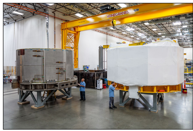
Two modules of the ITER Central Solenoid at GA's Magnet Technologies Center

Of all our ITER contributions, we are most closely associated with the ITER Central Solenoid—a pulsed, superconducting electromagnet and the most powerful of its kind worldwide. Serving as the "heart" of ITER, it occupies the tokamak's core, driving the plasma's current. To fabricate the Central Solenoid modules for ITER, GA established the state-of-the-art Magnet Technologies Center facility in 2015.