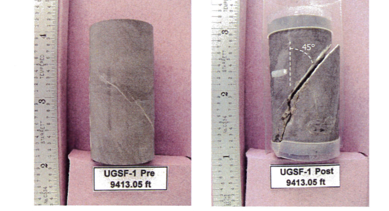
Figure 1. Standard rock mechanics testing, such as triaxial shear can help to delineate peak and residual shear resistance.

Controlled, carefully monitored experiments at a well characterized location would be valuable for improving our comprehension of the role and characteristics of natural discontinuities and their associated stress regimes.