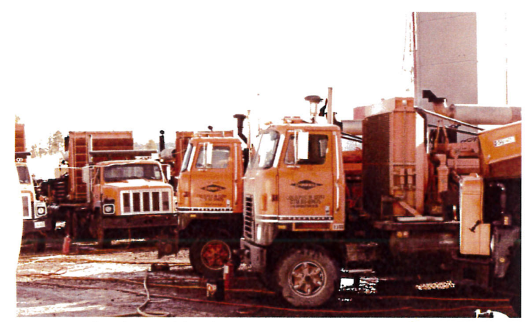
Figure 3. Part of a substantial frac fleet brought together for high rate, long term hydraulic fracturing at the Fenton Hill site in December 1983.