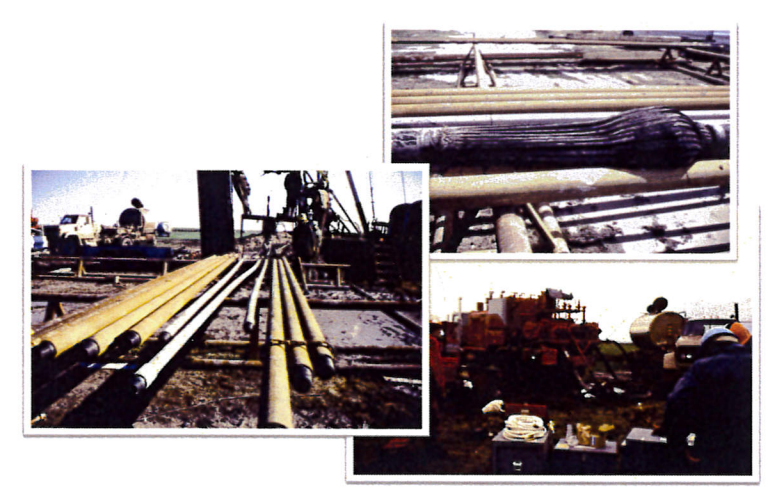
Figure 2 . Regardless of the element type (inflatable for openhole or compression packer for casing), high differential pressure (pumping equipment is shown in the lower right) and temperature challenge reliability. Upper right is a failed inflatable packer. Lower left is tubing damaged as a result of energetic packer failure (refer to McLennan et al., 1986<sup>16</sup>).

With a feverish development pace in oilfield applications, isolation technologies have dramatically improved. The value of these technologies in the geothermal sector is evident by assessing the proposed isolation methods from only a few years ago (Walters et al., 2012<sup>13</sup>). Horizontal completions and isolation protocols have developed substantially since then (for example, Packers Plus, 2016<sup>14</sup>). Regardless, the issues that need to be resolved – with funding and controlled experimentation include packer simplicity and reliability, component tolerance of temperature, and ability to withstand significant differential pressure ( Figure 2 ). Deep, high temperature and highly stressed environments will continue to mandate research on isolation tools (Song et al., 2015<sup>15</sup>).