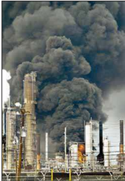
Smoke and fire caused by the Tesoro explosion