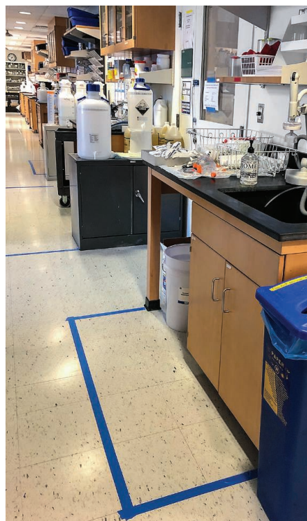
Markings are placed on the floor of an empty lab to promote social distancing.

to supporting the teaching and service missions of higher education—and health care delivery within academic medical centers—academic research contributes greatly to global economic development. In the United States, for example, higher education institutions accounted for $74 billion, or ~13%, of the $580 billion spent nationally on research and development in 2018 (1). More critically, these same institutions accounted for nearly half of the $96 billion spent on basic research nationwide, often seen as the seed corn for innovation and industry. Moreover, academic research institutions are among the top five employers in 44 of 50 U.S. states, employing more than 560,000 people (and more than 300,000 trainees) directly on research funds (2), many of which cannot perform their work remotely.