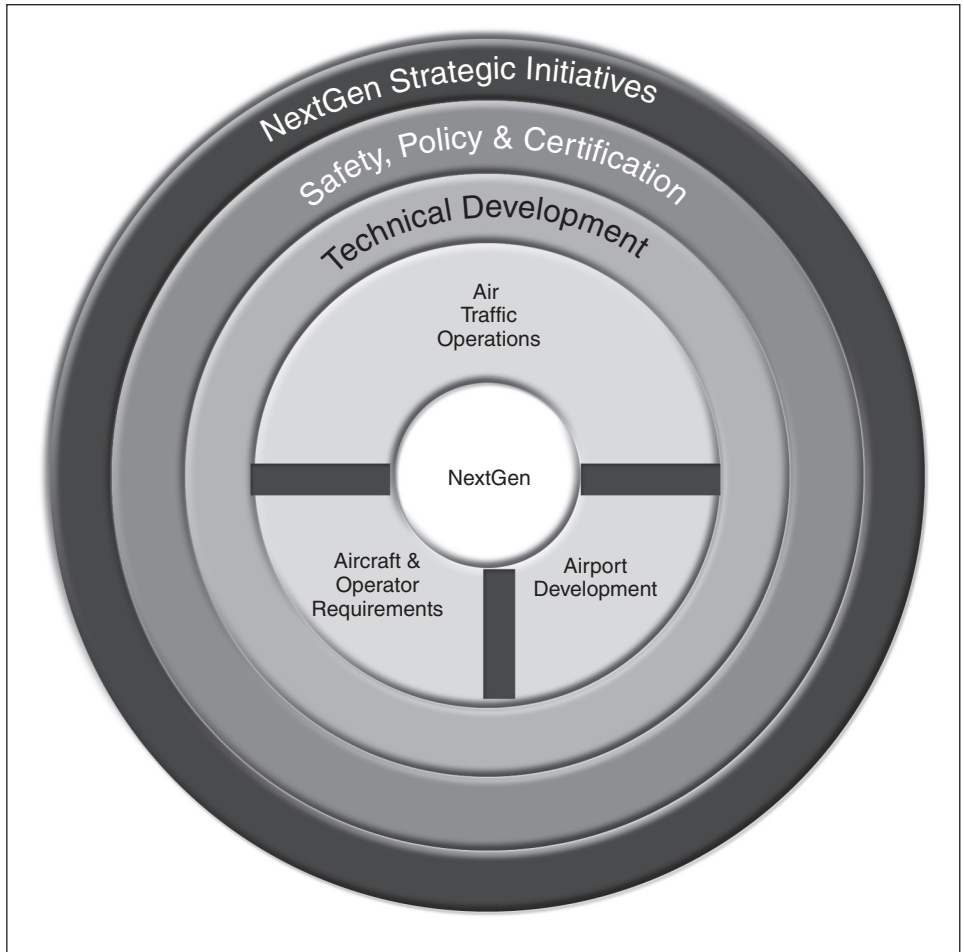
Figure 3: New OEP Framework