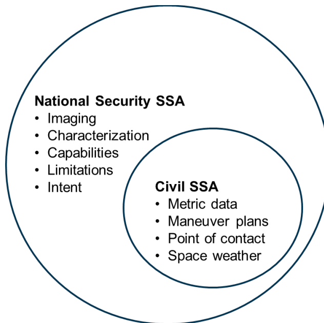
Figure 3. Division of labor between national security and civil SSA authorities

This non-DoD entity would be mainly an integrator of data collected by other entities, rather than a primary collector itself. The DoD would still operate its existing networks of radars and other sensors, many of which perform missions other than SSA. However, the DoD would be responsible for passing sanitized data from its tracking networks to this non-military organization. The non-DoD entity would be responsible for maintaining a catalog of space objects and information about space weather. This would enable them to provide conjunction analyses and other safety-related services to all space actors to support safety of spaceflight and space sustainability. The DoD would retain responsibility for national security aspects of SSA, including characterizing space objects and determining intent and threats, by combining the civil SSA data with other sources of data. Figure 3 provides a graphical summary of this division of labor.