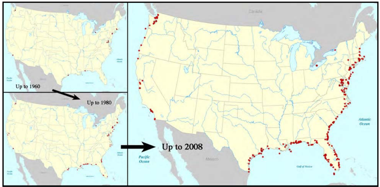
Figure 2. Change in number of U.S. coastal areas experiencing hypoxia from 12 documented areas in 1960 to over 300 now. Not shown here are one hypoxic system in Alaska and one in Hawaii.