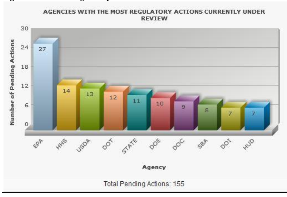
Figure 1. OIRA's Regulatory Review Dashboard<sup>6</sup>

EPA regulations are playing a greater role in the overall federal regulatory enterprise as measured in rulemaking and overall costs and benefits. According to OIRA's Regulatory Review Dashboard, (see Figure 1) EPA has nearly twice as many regulatory actions currently being reviewed than any other part of the federal government.